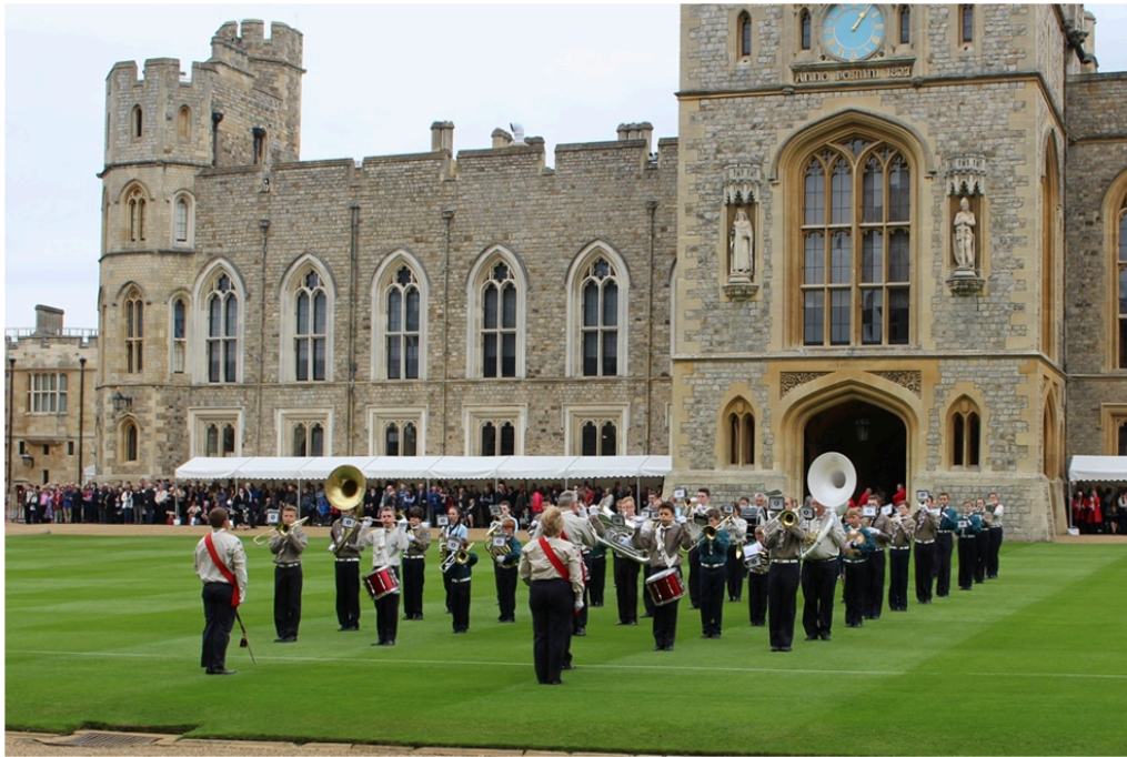
(The band at the Windsor Castle)