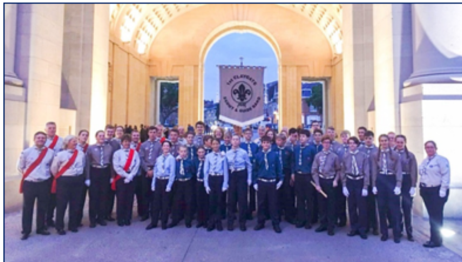
(The band at the Menin Gate, Ypres – September 2018)